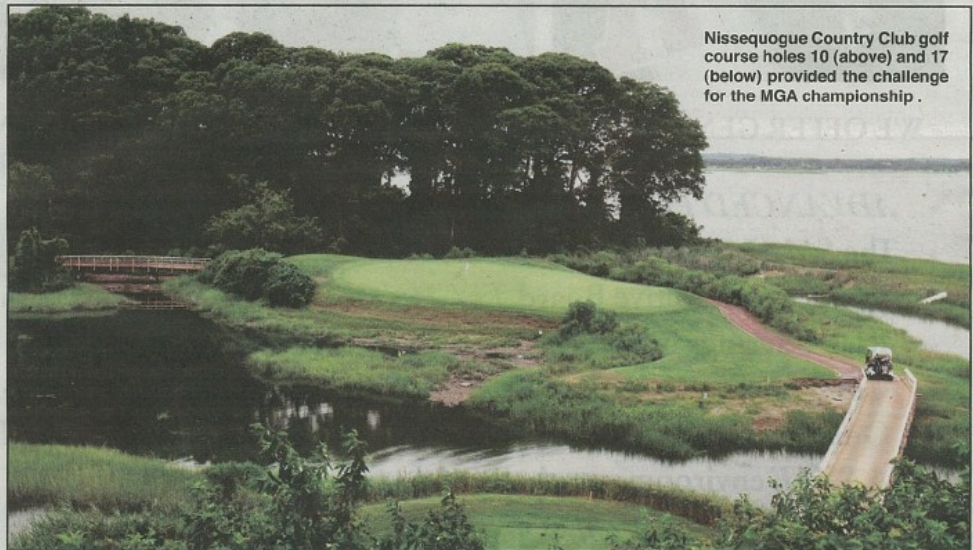
Nissequogue Country Club golf course holes 10 (above) and 17 (below) provided the challenge for the MGA championship.

The MGA also received a great deal of support from the course's frequenters. "The interest of the members is